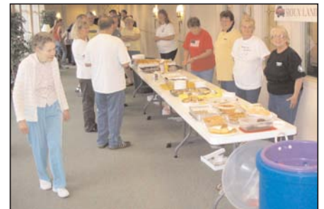
Great Plains Street Rodders was the host club at Bethany Meadows in Brandon. The night was successful beyond projections and the food ran out.

Now that the summer busy season has ended, our website will be going through some changes. Keep checking www.greatplainsstreetrodders.com for new updates.