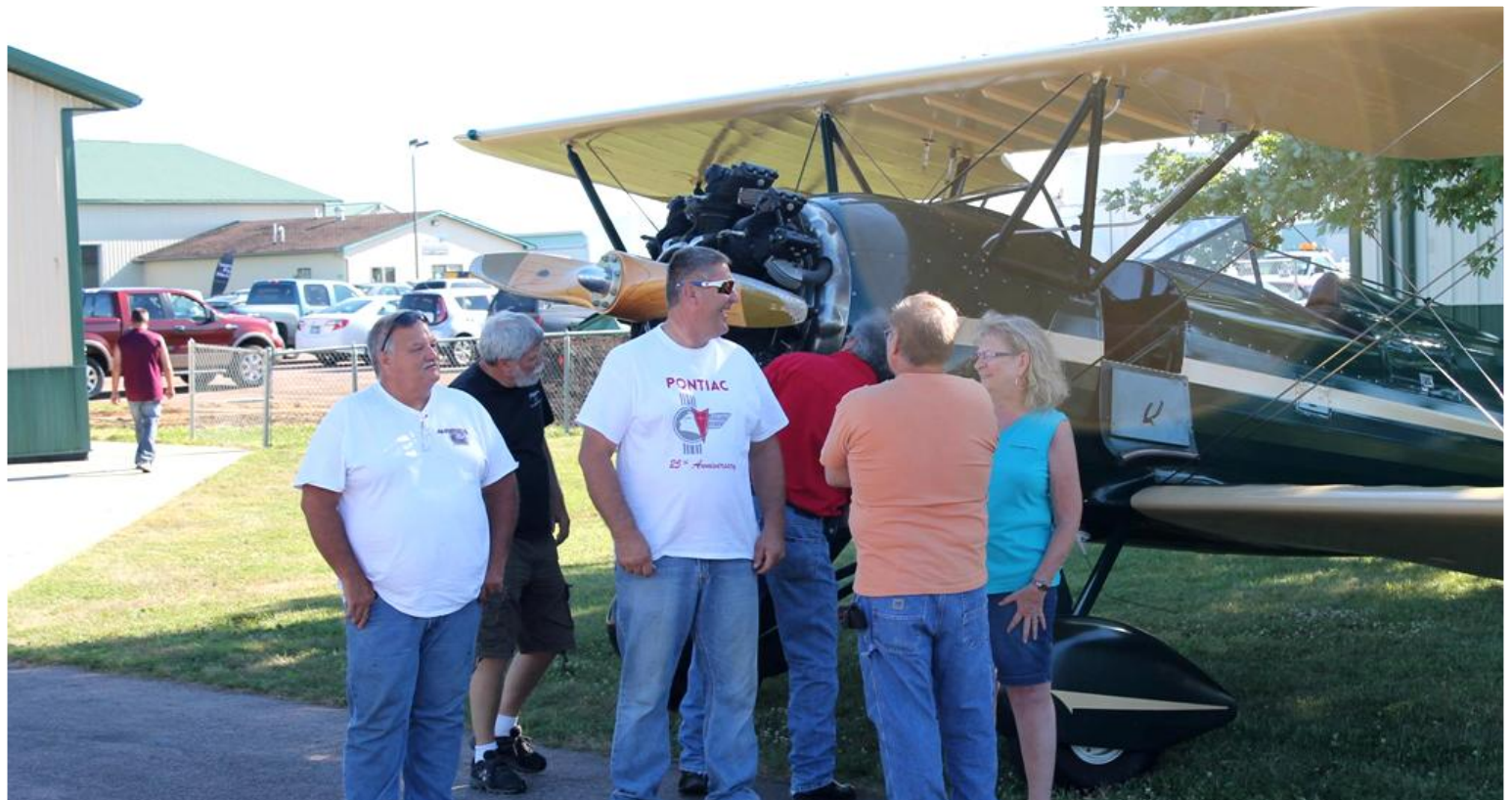
Great Plains Street Rodders showed off their cars and enjoyed seeing and riding in the planes at a recent fundraiser at the Lincoln Co. Airport.