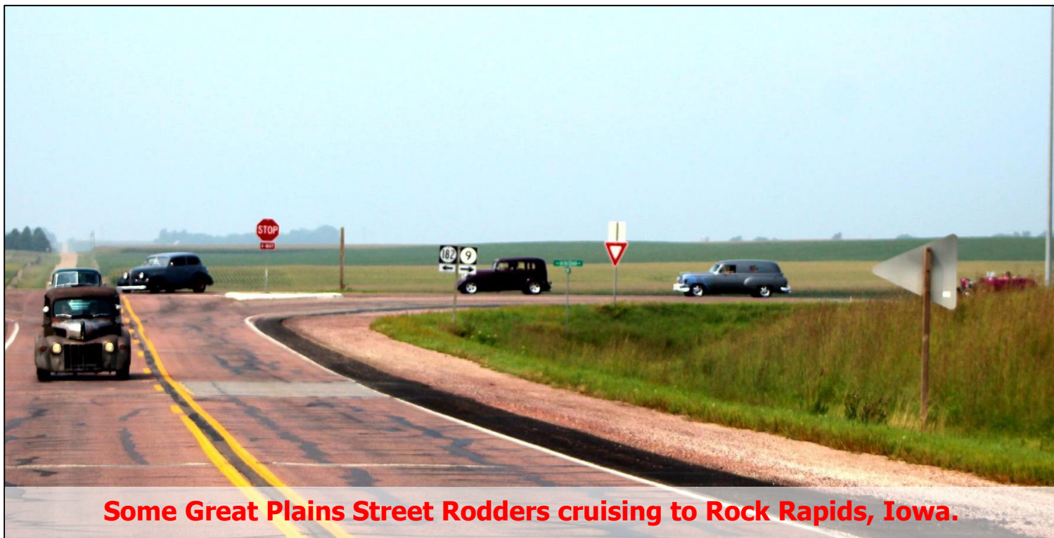
Some Great Plains Street Rodders cruising to Rock Rapids, Iowa.

For a color copy of the newsletter or to see additional photos, go to our website greatplainsstreetrodders.com .