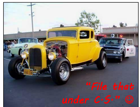
"File that under C.S." 😊