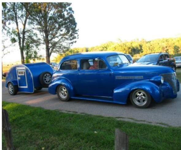
Jack and Dianne cruising in their '39 Chevy at Watertown.