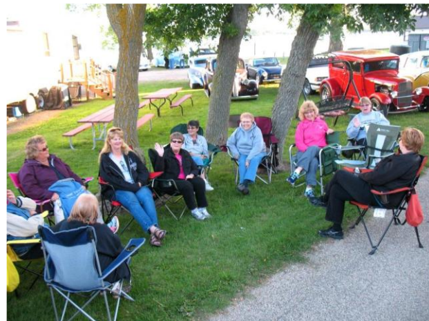
Friends enjoying the day at the Watertown Rod Run.