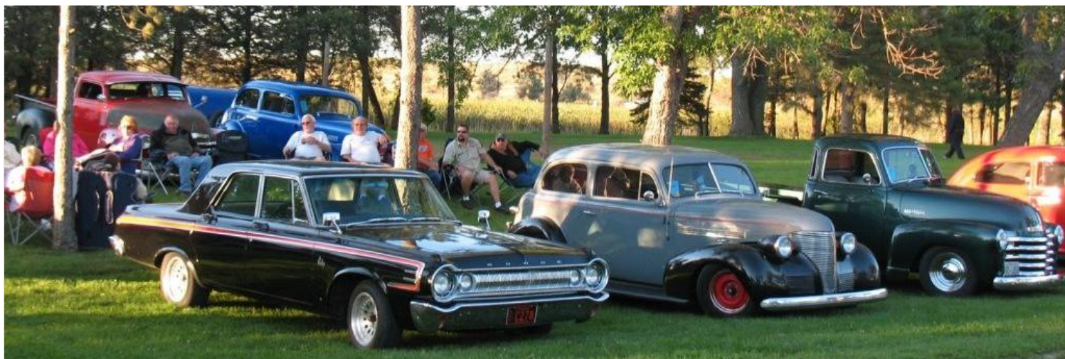
Just some of the cars and crowd of Great Plains Street Rodders enjoying the evening at the 2014 Vintiques Rod Run in Watertown.