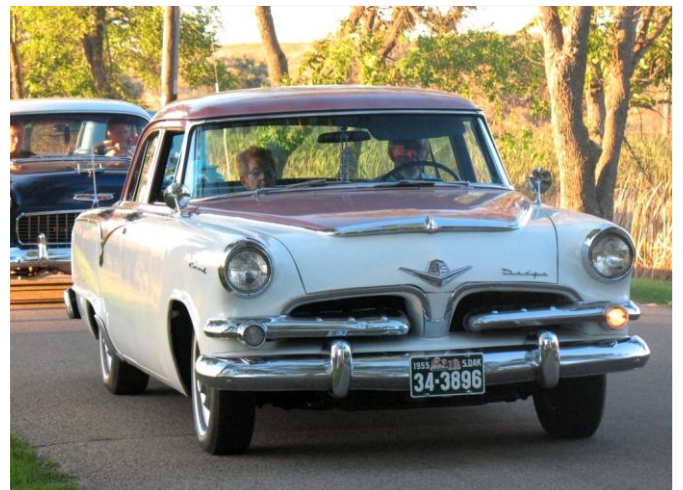
Faye and Gary cruising around Watertown in Gary's '55 Coronet