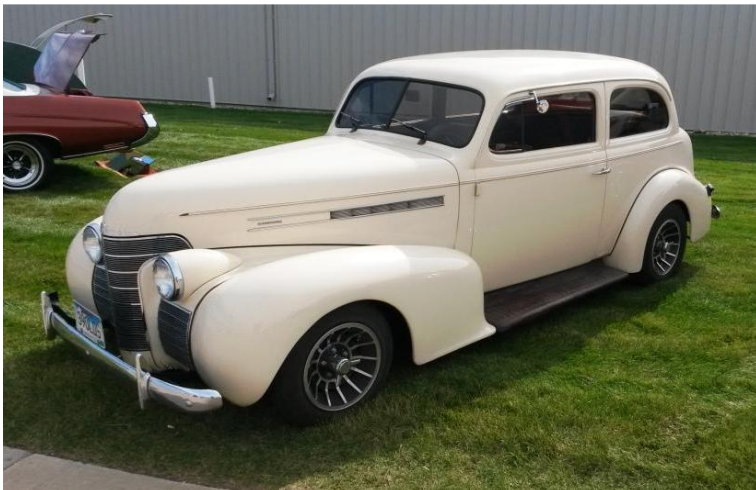
Jim Kuhle's '39 Oldsmobile at NAPA in Tea, "Last Fling 'til Spring"