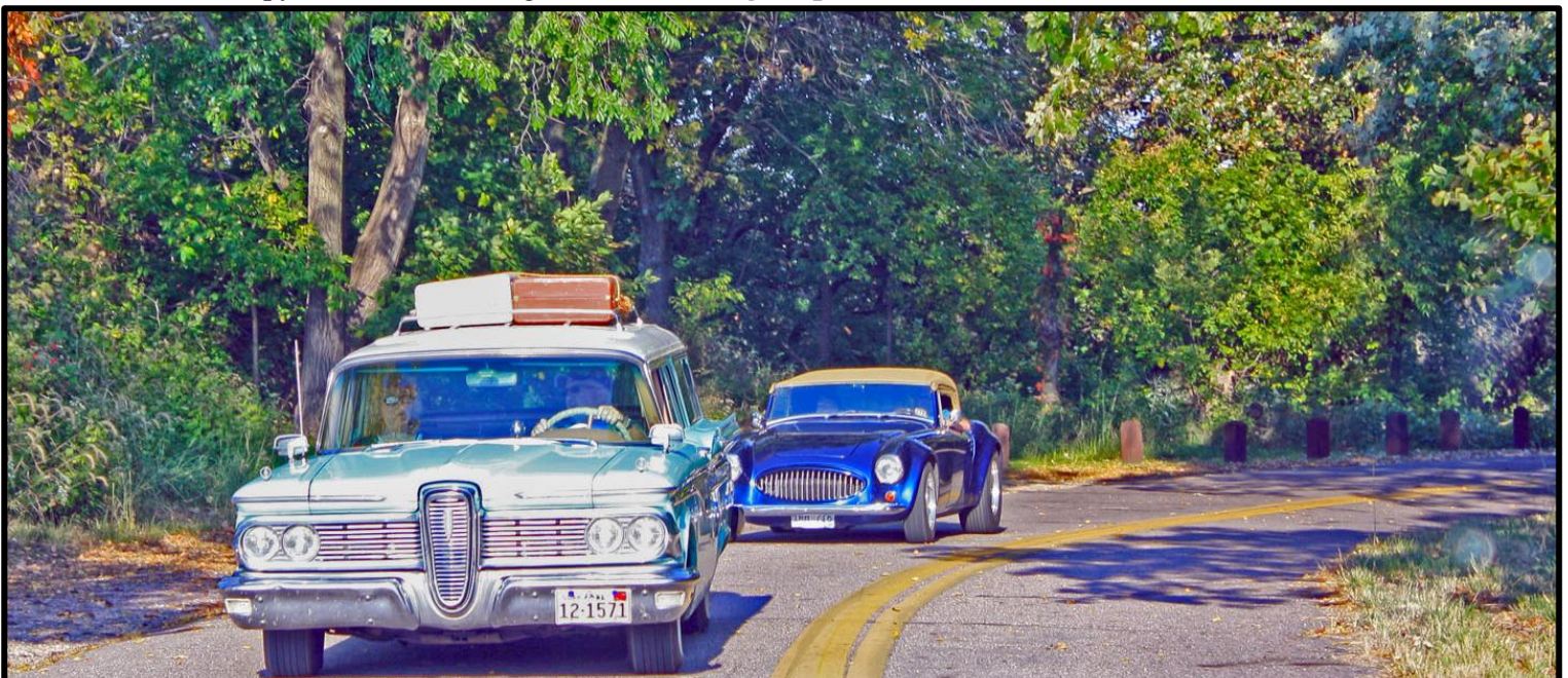
A Josie Bowers' picture as the group cruised Loess Hills Scenic Byway. Check out our website to see more.

For a color copy of the newsletter, go to our website greatplainsstreetrodders.com .