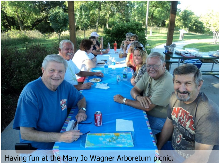
Having fun at the Mary Jo Wagner Arboretum picnic.