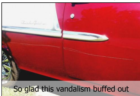
So glad this vandalism buffed out

We've all made thoughtless mistakes, so the saddest damage is that which is done intentionally. ☹