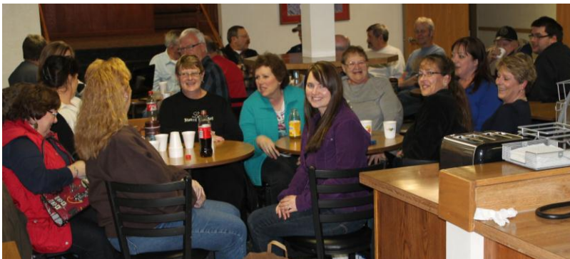
Club members relax at the Super 8 after a big meal at the Golden Corral.