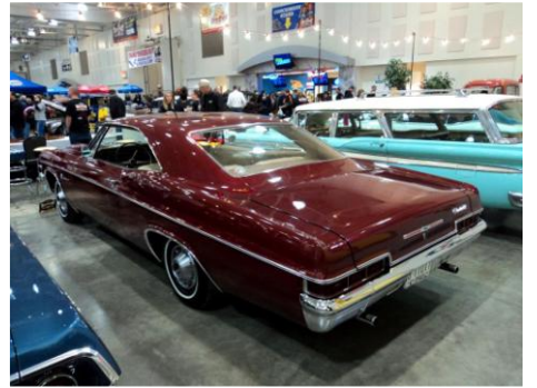
Faye Gallagher's '66 Chevy Impala