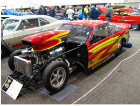
Terry Koch's '91 Ford Probe – 2013 Top ET Champion, Thunder Valley