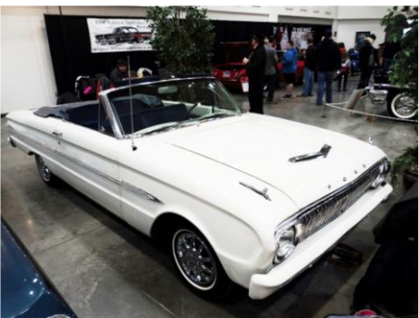
Gary Ebright's 1963 Ford Falcon