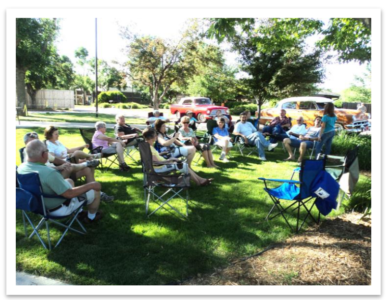
Relaxing at the Children's Home Society Root Beer Social