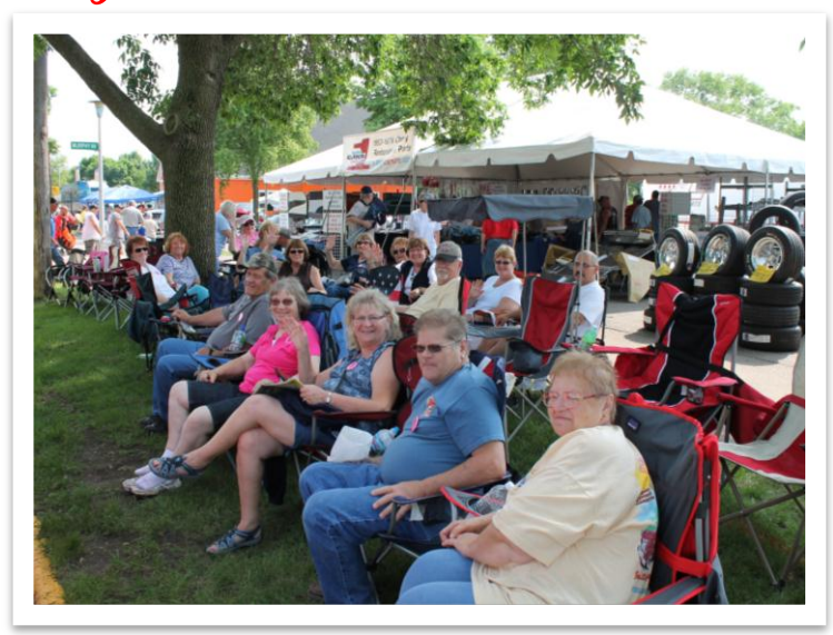
GPSR members at the 40<sup>th</sup> Annual Back to the Fifties