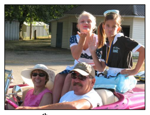
July 27<sup>th</sup> – Classic Car Parade 7:00 p.m start time. Convertible owners see Clay to chauffer.