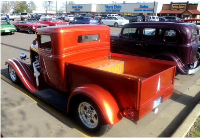
Cheryl Van Noort's '33 Ford at the Pizza Ranch Cruise