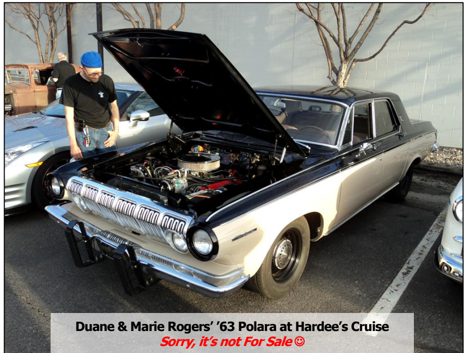
Duane & Marie Rogers' '63 Polara at Hardee's Cruise Sorry, it's not For Sale ☹

FOR SALE – 1967 Stick , 67K mi, Royal blue w/speckles, Volkswagon original engine with roll bar, racer seats, steering wheel, new struts two years ago. Owned for 30 yrs. Always garaged & covered. Includes heavy duty canvas cover. $5000, Candy N. 605-376-6252