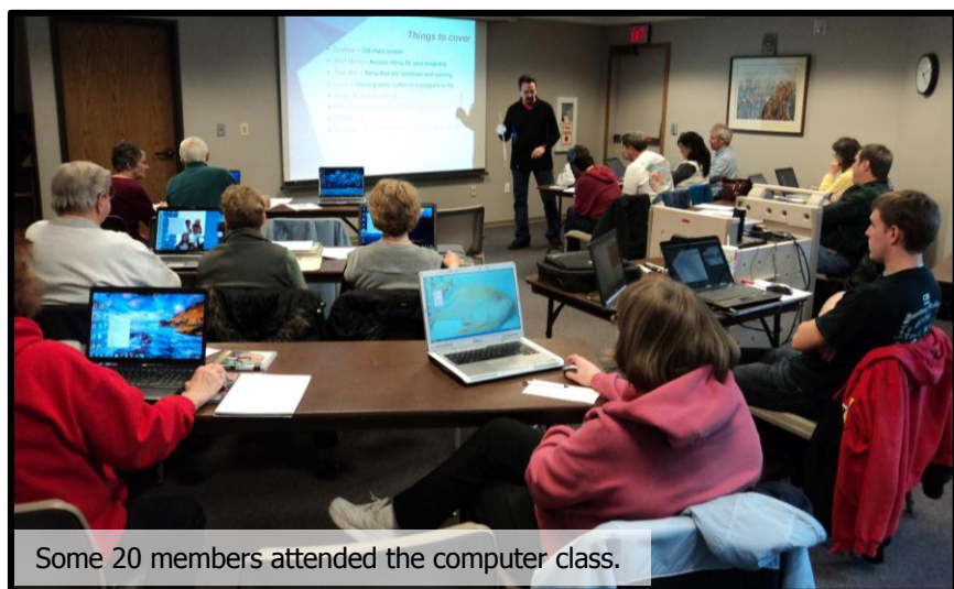
Some 20 members attended the computer class.