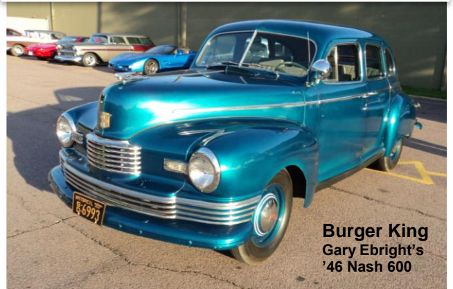
Burger King Gary Ebright's '46 Nash 600