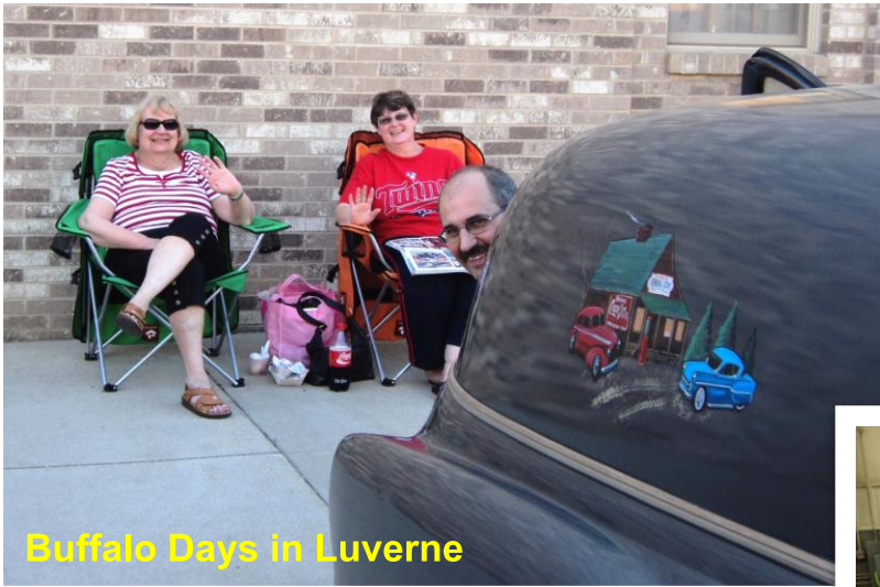
Buffalo Days in Luverne