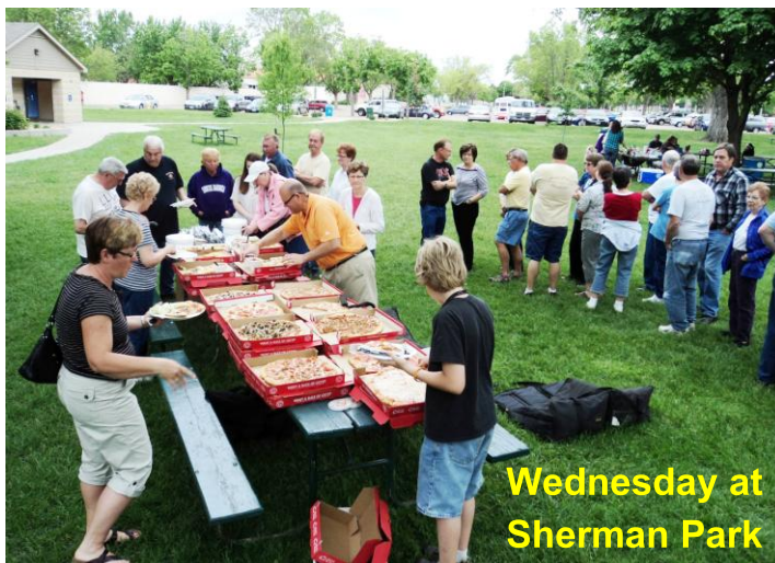
Wednesday at Sherman Park