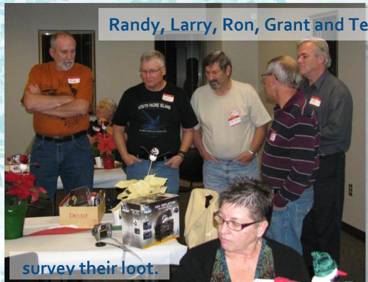
survey their loot.

Of course, it's all in good fun, and we're still friends at the end of the evening.