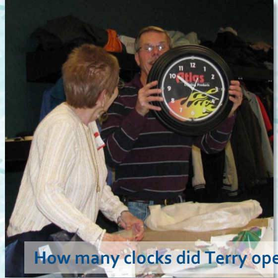
How many clocks did Terry open?