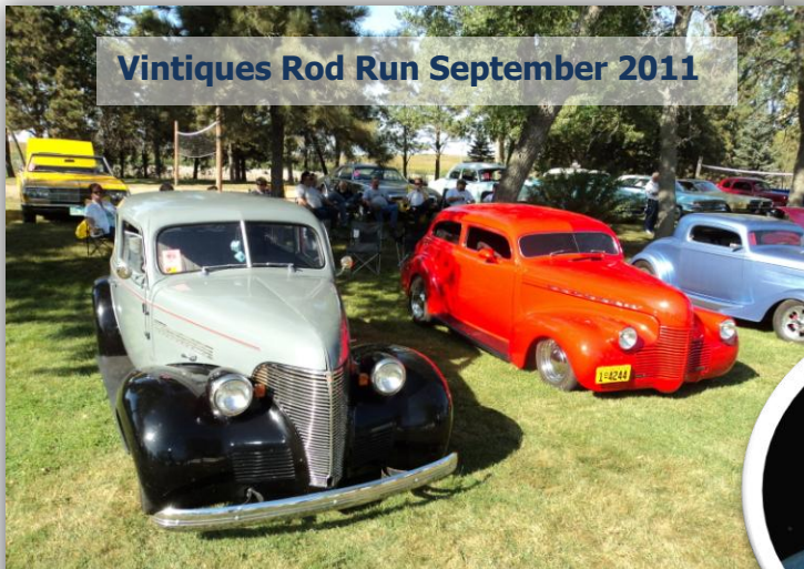
Vintiques Rod Run September 2011