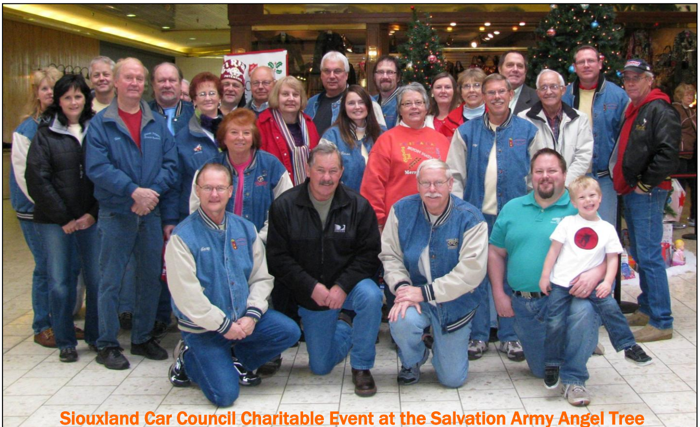
Siouxland Car Council Charitable Event at the Salvation Army Angel Tree