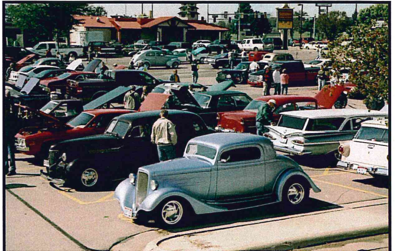
Wheels for Charity Car Show was a success, even if it did rain Suatuday morning. Look for the editorial next month.