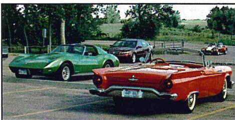
Car enthusiasts gathered at Wall Lake in July for a grill-out hosted by the Sioux Empire Ford Club.