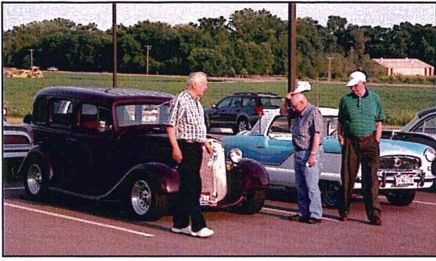
Residents of the Bethany Meadows Retirement Center were treated to some fond memories when the Great Plains Streetrodders brought their old cars to the Brandon facility for a visit last month.