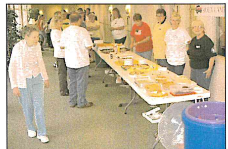
Great Plains Street Rodders was the host club at Bethany Meadows in Brandon. The night was successful beyond projections and the food ran out.

Now that the summer busy season has ended, our website will be going through some changes. Keep checking www.greatplainsstreetrodders.com for new updates.