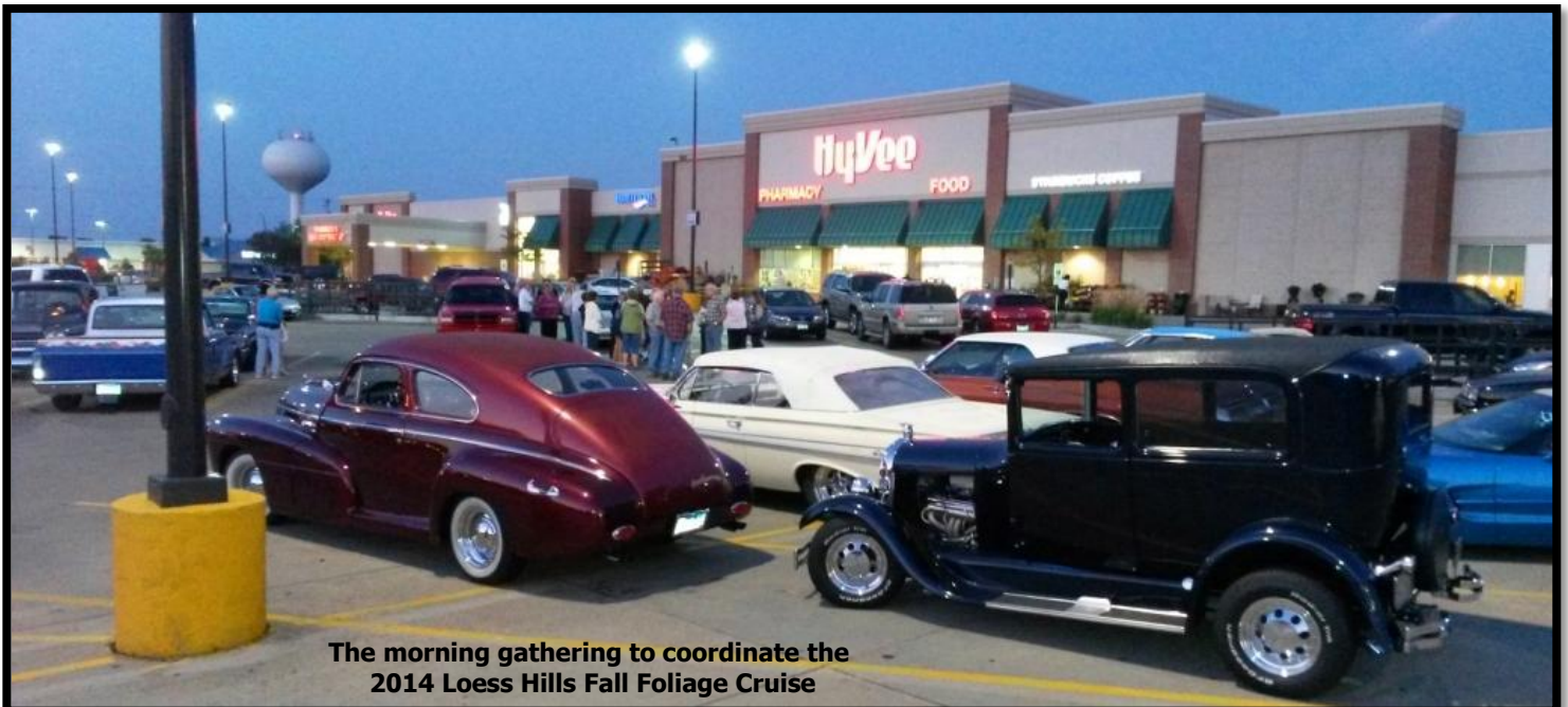
The morning gathering to coordinate the 2014 Loess Hills Fall Foliage Cruise

For a color copy of the newsletter or to see additional photos, go to our website greatplainsstreetrodders.com .