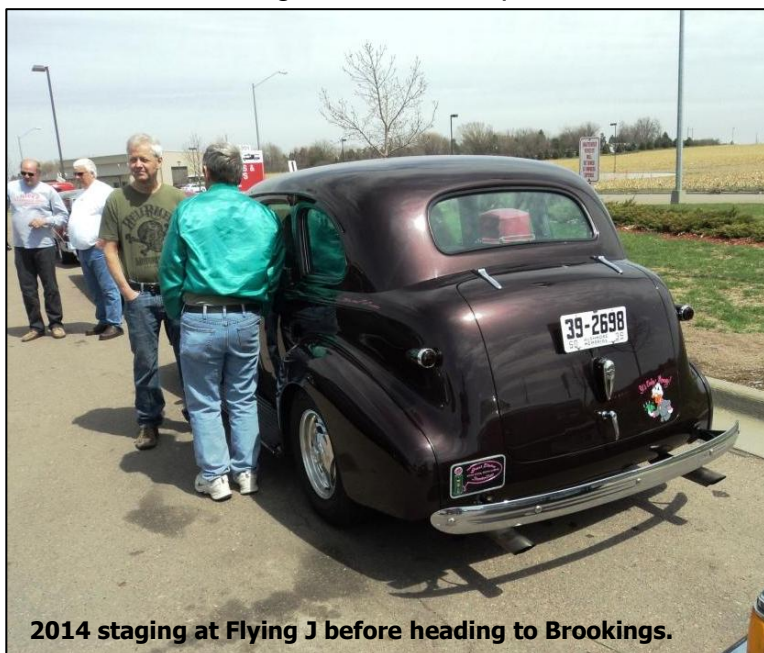
2014 staging at Flying J before heading to Brookings.

Nick's Burgers Cruise is April 25th. We will meet at the Flying J at 12:30 and leave at 12:45.