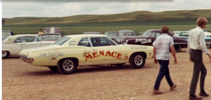
Jul - 69