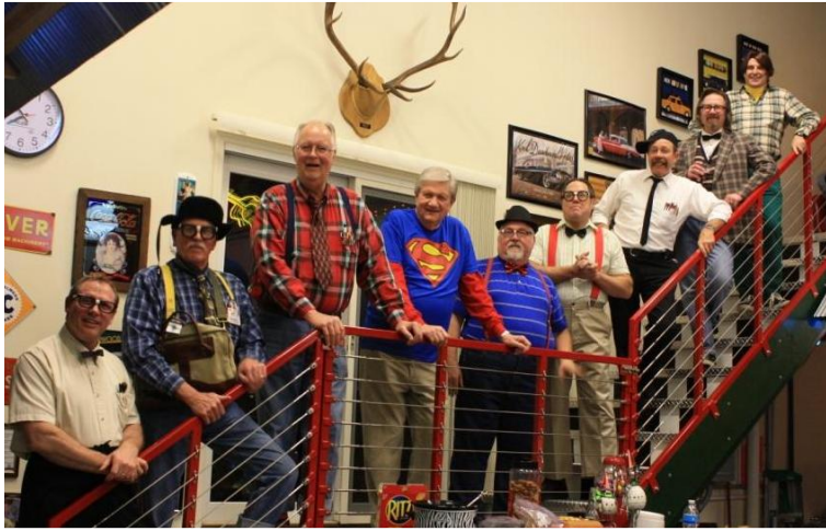
What a nice looking group of nerds!