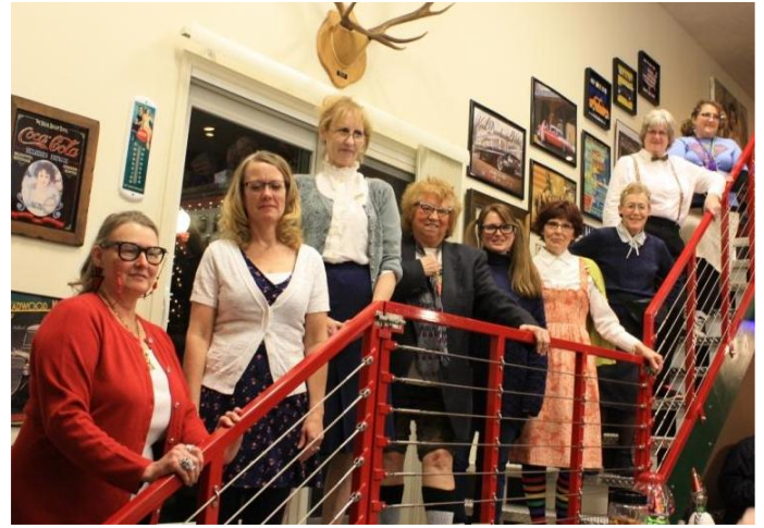
The nerdettes are looking their best for the judges.